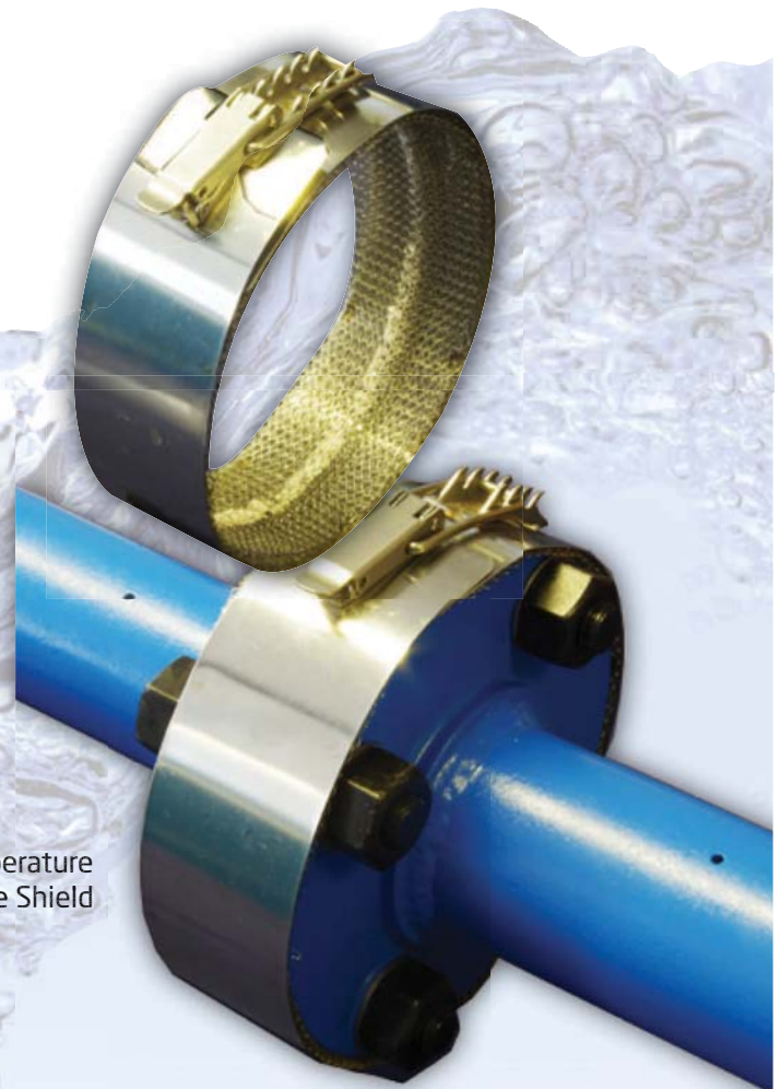
Stainless Steel High Temperature and Pressure Flange Shield

The stainless steel band securely clamps around the flange (different widths are available). A layer of stainless steel netting around the inside diameter of the shield dissipates any pressurised spray by directing it around the flange circumference. This shield is again designed for fitting without tools, has smooth corners to avoid sharp edges and is designed for the flange bolting to remain visible when fitted.