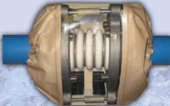
Universal PTFE coated Bellows Shield

As non-metallic bellows generally only have a single layer of PTFE or rubber between the media and the outside world and as by definition they are subject to flexible movement throughout their lives we strongly recommend safety shields on bellows applications. These shields are suitable for PTFE, rubber and metallic bellows and are of course designed to function with the range of movements expected in the bellows.