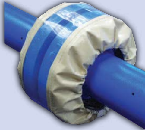
Universal PTFE coated Flange Shield

A product option is to have a PTFE drain attached. This can route any leak to site containment using PTFE tubing as a push fit. This is popular in high traffic areas or where sensitive electronic equipment is in the vicinity. Alternatively it can act as a drain for leaks, a vent for rainwater or moisture or as an emissions test port. It is also possible to fit pH indicator paper to indicate the presence of acids or alkalis.