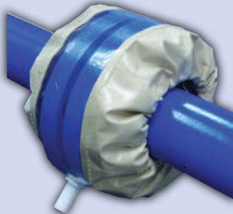
Flange Shield fitted with PTFE Drain